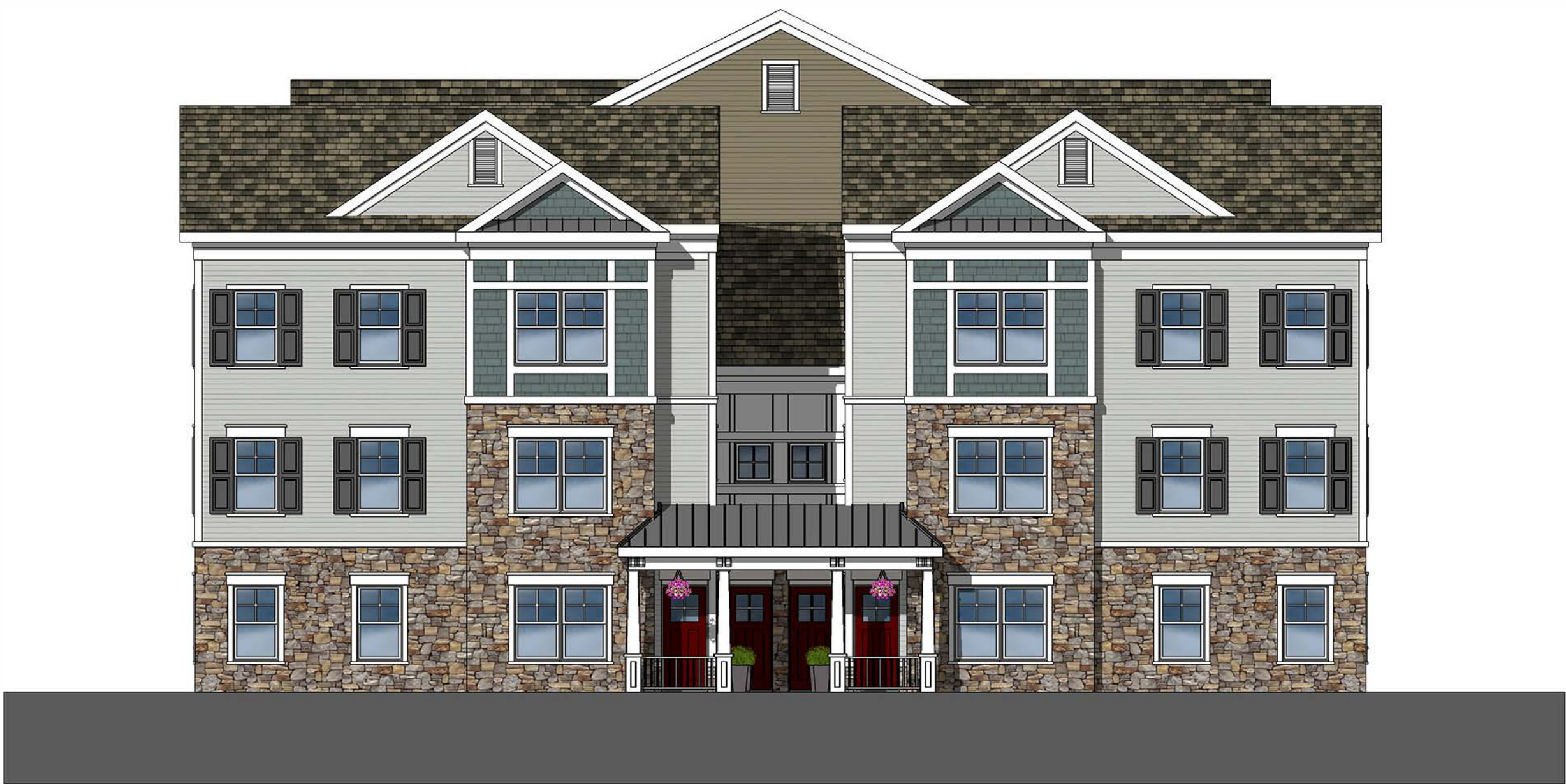
4 - LEFT SIDE ELEVATION