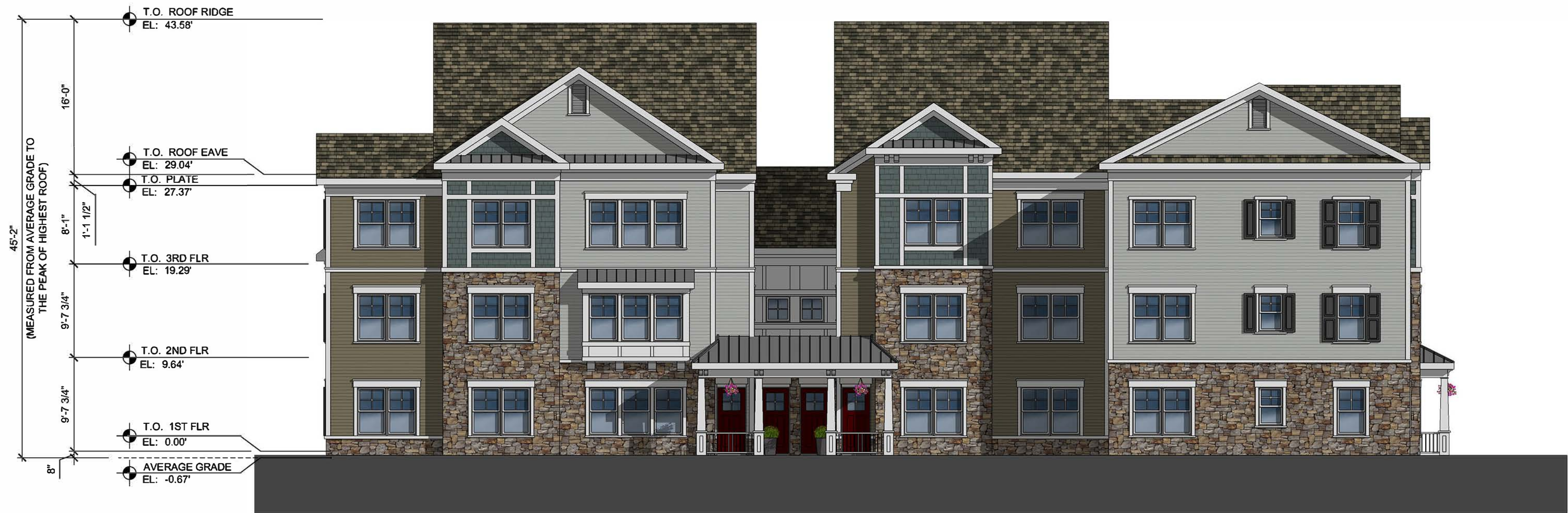
3 - REAR ELEVATION