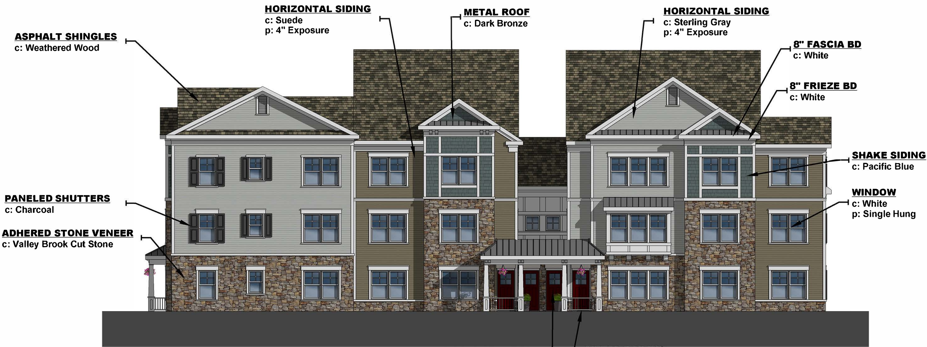
1 - FRONT ELEVATION