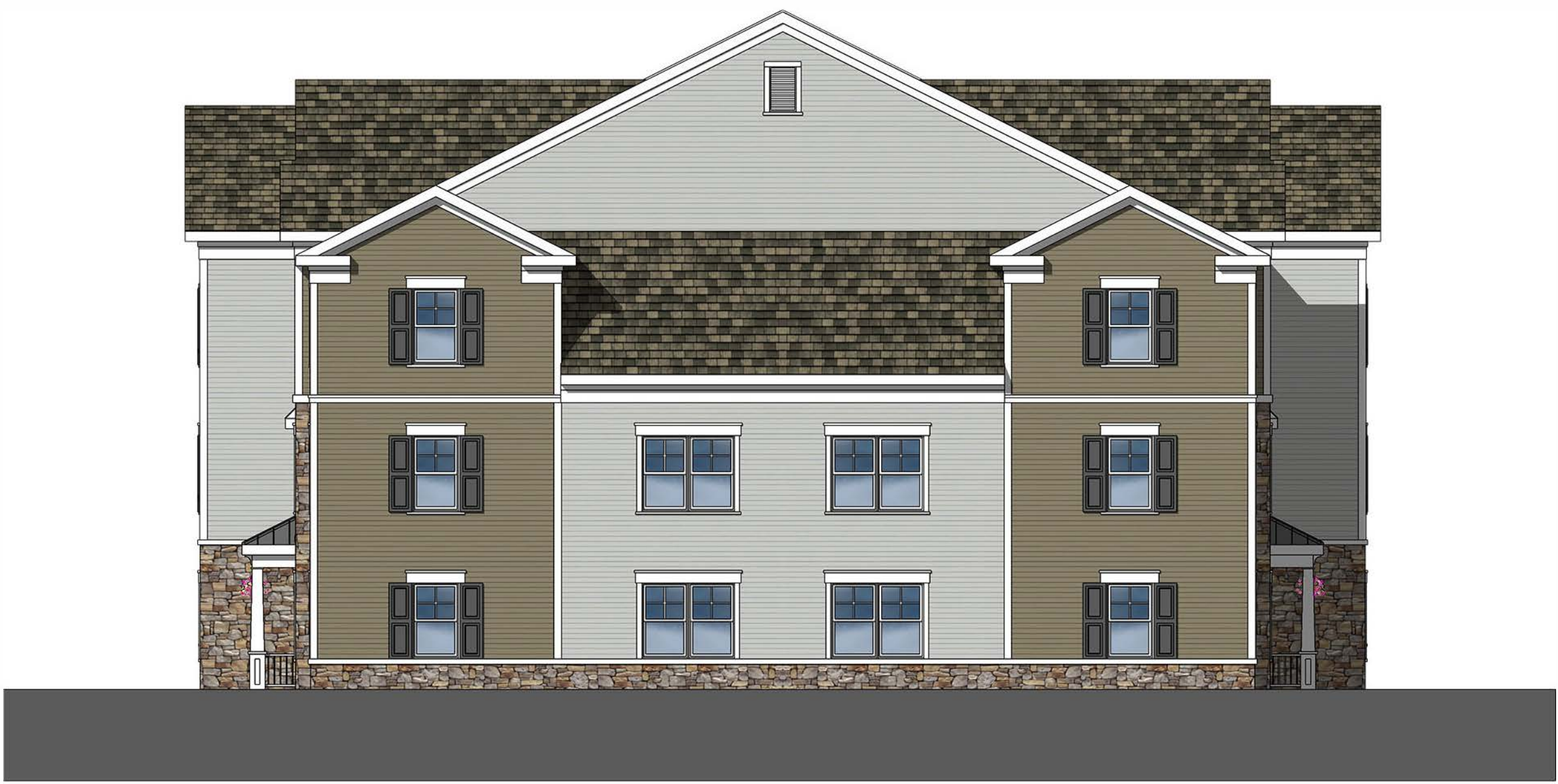
2 - RIGHT SIDE ELEVATION